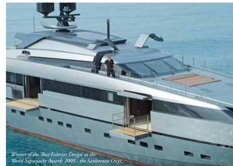
Winner of the 'Best Exterior Design' at the World Superyacht Awards 2009 - the Sanlorenzo Onyx.

Despite the stories you heard as a child, the hare will almost always beat the tortoise. The same goes for motor yachts. Sail yachts will never compete, except the 280-footer Maltese Falcon from Perini Navi. For the sake of clarity, that makes the Maltese Falcon the largest sailing superyacht in the world. Although it could easily be mistaken for a modern-day pirate cruiser (no Somalians have placed orders just yet), its three grand rotating masts of 15 sails give the Falcon a distinctive identity, even from a distance. With a capacity for 150 guests, the triple-decker does not only score points in size, but also in decor. This 2006 creation, built for Silicon Valley pioneer Tom Perkins, may not be the freshest fish in the sea but its level of luxury and performance still outweigh more recent sailing yachts. It is not too late to have a go; the word on the street is that the Maltese Falcon is back on sale.