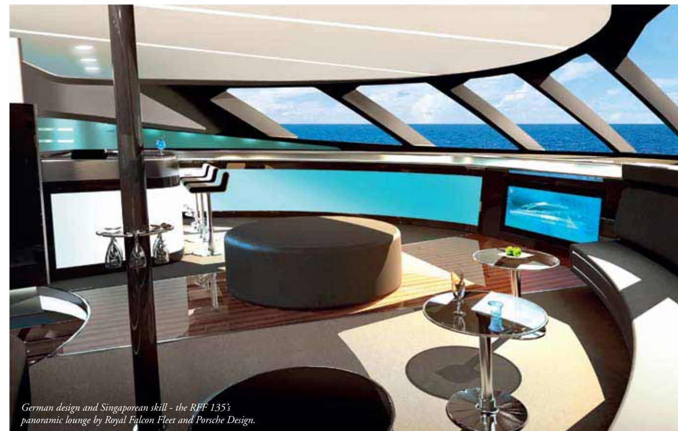
German design and Singaporean skill - the RFF 135's panoramic lounge by Royal Falcon Fleet and Porsche Design.