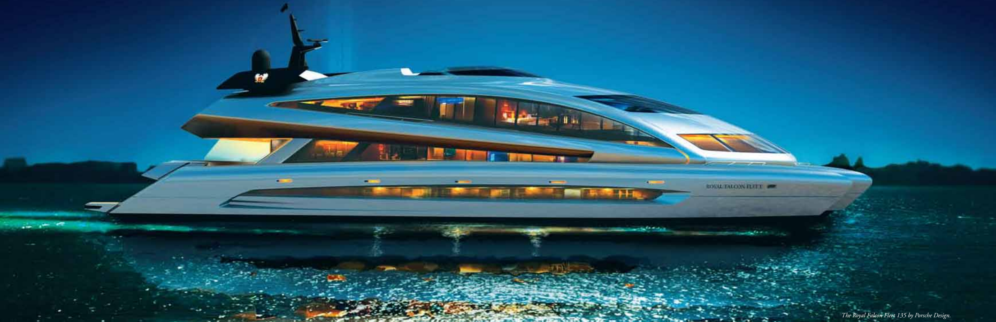
The Royal Falcon Fleet 135 by Porsche Design.